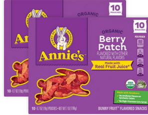
Annie's Organic Fruit Snacks selected varieties