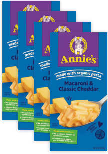
Annie's Mac & Cheese selected varieties