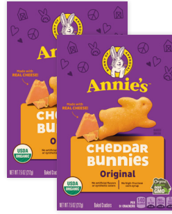
Annie's Organic Bunny Crackers selected varieties